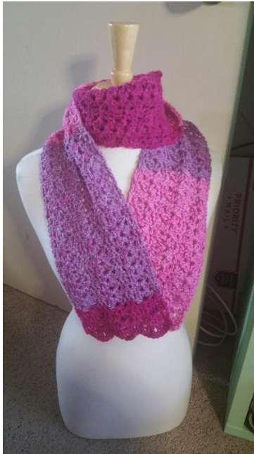
Double Delight Scarf